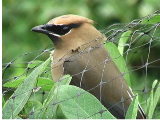
Figure 6. Help me!!!

Birds, particularly Cedar Waxwings, love Haskap. For 3 years they ignored our berries but then they wiped out 2 years of crops before we bought bird netting. I recommend using a ½ inch netting. If you buy the cheaper 1 inch you will have birds stuck with their heads in the net. It's pretty gross especially when they are dead. Waxwings will 'freeze' when trapped and it is fairly easy to remove them. They don't try to attack you. A grower suggested buying a type of bailing netting for round straw bales. I was told this may be 1/4 th the price of regular netting but is likely to have a 1inch hole so you could have a bird problem. It might only last a year.