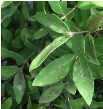
Figure 7. Mildew on a susceptible cultivar. So far the U of S has been highly resistant to powdery mildew but many varieties get it in mid July. This disease may not matter much to the farmer but could be rather ugly in your yard.

Diseases: The only diseases we have seen is powdery mildew which starts in the heat of July, well after harvest. Susceptibility varies tremendously between varieties. Some varieties are severely affected while others appear immune. Our new selections are very resistant except for 9-15. (9-15 had twice the yield and may have been particularly stressed that year from the heavy fruit load).