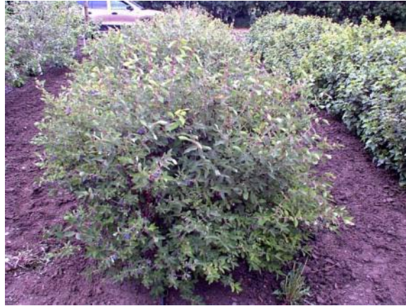
Figure 4. Haskap bushes are well behaved. They don't sucker and have a nice rounded shape. When Haskap get older they need to be thinned.