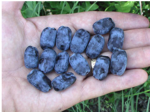
Figure 2. 'Tundra' is a new U of S cultivar recommended for fruit growers.