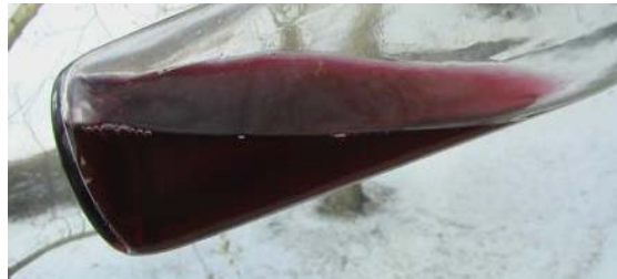
Haskap wine and juice has a deep burgundy colour.

Haskap makes excellent wine, some say similar to grape or cherry wine. The wine will be a rich burgundy colour. Its juice has perhaps 10 to 15x more concentrated color than cranberry juice.