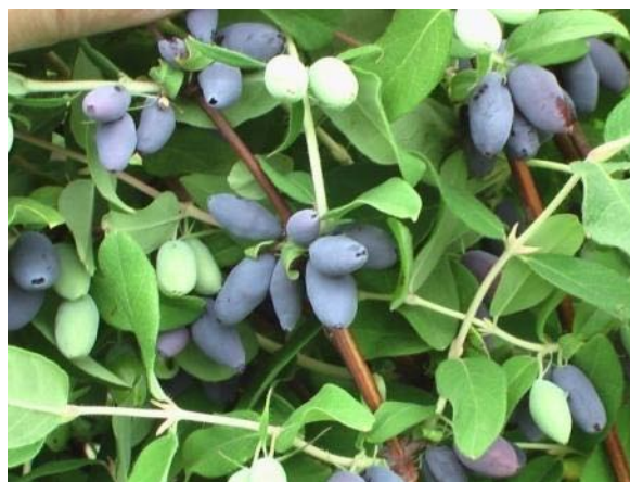
Figure 3. A Russian variety beginning to ripen. Wait for all berries turn blue on the outside. The inside will be purple (not green) when fully ripe.

Horrible tasting, ornamental versions of this plant were bred in the 1950's at a research station in Beaverlodge, AB which probably caused fruit breeders in North America to be completely disinterested in this plant.