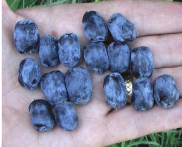
Figure 1. 'Borealis' is a new cultivar recommended for home gardeners.