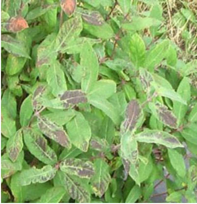
Figure 8. Sunburn? No diseases or pests were found that could explain this disorder. This too is highly dependent on what variety is grown. The new U of S varieties are highly resistant to this. It has been suggested by an American nursery that perhaps this problem is caused by high temperatures.